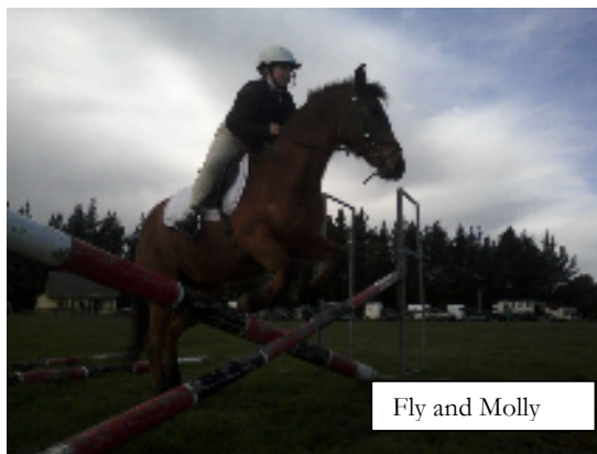
Fly and Molly